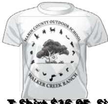
A. T-Shirt $16.95 Sizes: Adult S, M, LG, XL, XXL