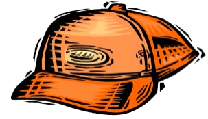
C. Adult Size Cap $18.00 w/ "Walker Creek Ranch"