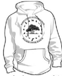
B. Hooded Sweatshirt $32.00 Sizes: Adult S, M, LG, XL, XXL