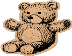
D. Bear with Ribbon $13.50