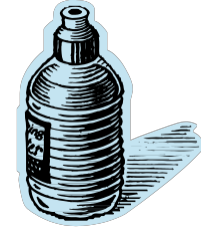
F. Stainless Steel Bottle $10.50